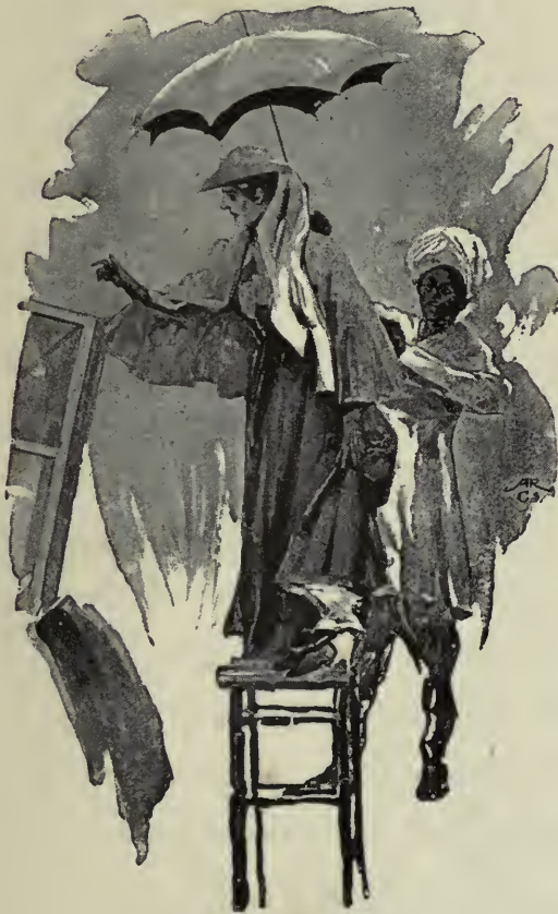
I GOT UPON THE STOOL.

my hesitation, the man on the elephant again shouted to it, and the creature slowly rolled over on its side so as to bring the howdah